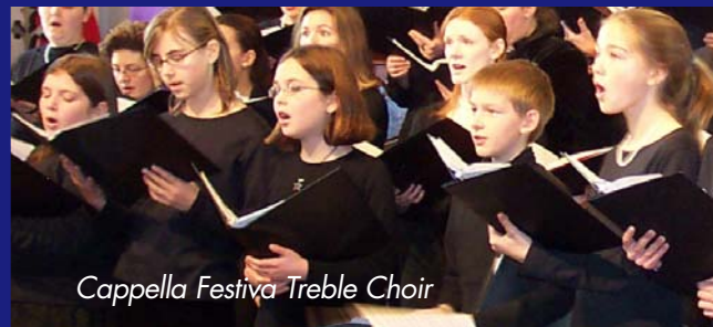
Cappella Festiva Treble Choir

Now in its fifth year, the Cappella Festiva Treble Choir continues to grow, providing an opportunity for young singers to explore diverse vocal repertoire. The Summer Festival has met with resounding success, as young artists gain valuable vocal training and musicianship skills in an intensive program. This past summer was