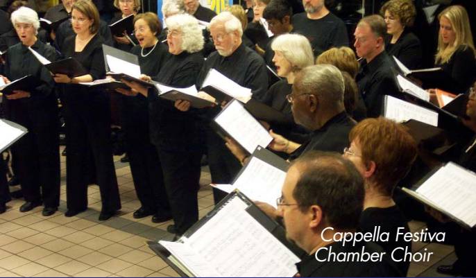
Cappella Festiva Chamber Choir

Cappella Festiva invites you to join us for a wonderful array of concerts scheduled throughout the year. We began as a small, professional choral ensemble - but over the years, we've emerged as one of the region's most unique music organizations. Today Cappella Festiva includes an auditioned adult chorus of professional and skilled amateur singers; an acclaimed Treble Choir for boys and girls ages 10-18; and an annual Children's Summer Choral Festival that provides young singers with an intensive two-week music experience.