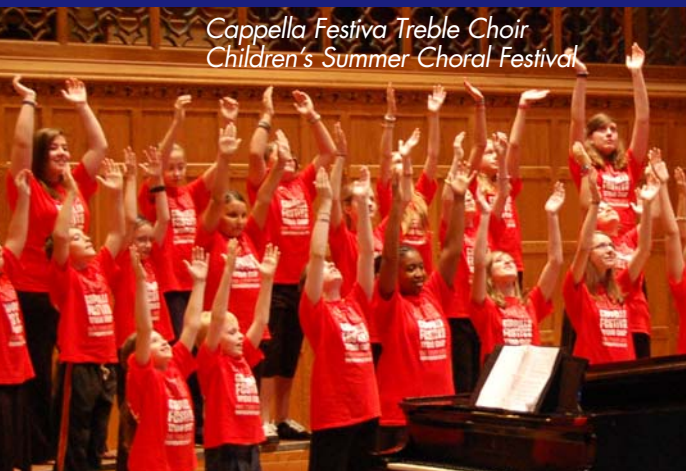
Cappella Festiva Treble Choir Children's Summer Choral Festival