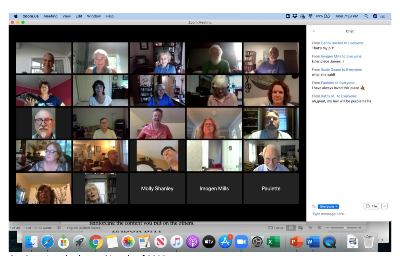
Our last virtual rehearsal in July of 2020.