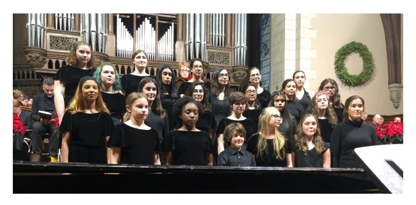
Our Treble Choir performed at Lessons & Carols on Sunday evening, December 8, 2019 to a packed and full chapel.